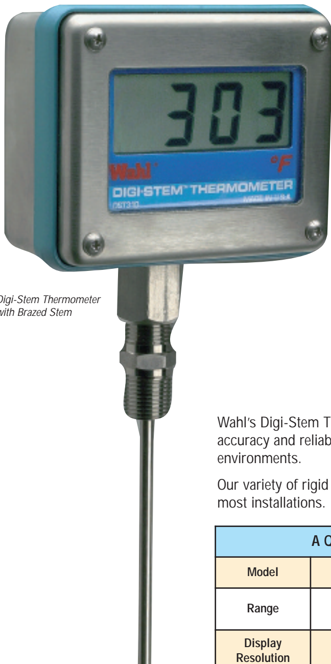
Digi-Stem Thermometer with Brazed Stem