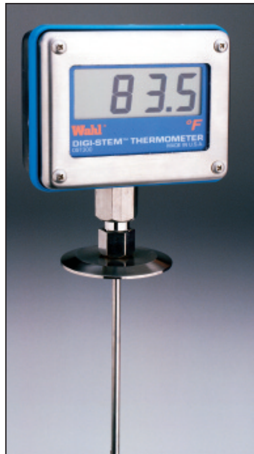
Digi-Stem with Sanitary Stem

Wahl offers loop-powered transmitter versions of Digi-Stem with continuous, digital, local display. The transmitter is an integral meter and electronics assembly in NEMA-4X housing with a 4-20mA, 2-wire current loop. Model DSX300 has a temperature range of 0 to 300°F (-18 to 150°C), while Model DSX310's range is 200 to 800°F (100 to 425°C). The transmitters incorporate all Digi-Stem family features, including stainless steel construction, large digital display, reliability, and rugged construction.