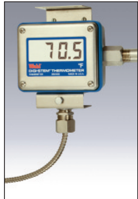
Digi-Stem Remote Transmitter with DSA3030 Wall Bracket

Specifications subject to change without notice